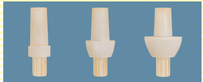
SKY temp S Order No. SKYTEMPS

The SKY temp plastic abutments are also ideal for modern implantological concepts such as progressive loading or immediate loading.