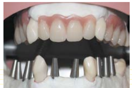
Completion of the restoration phase from the impression to the integration of the restoration.