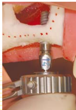
...with implant insertion