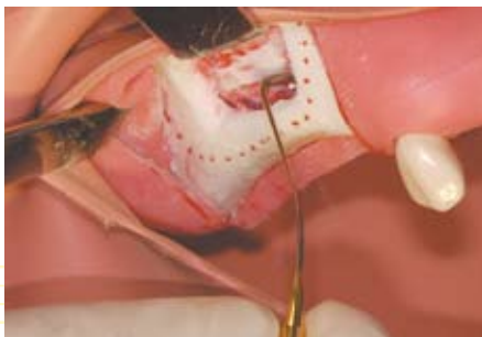
Direct sinus lift...