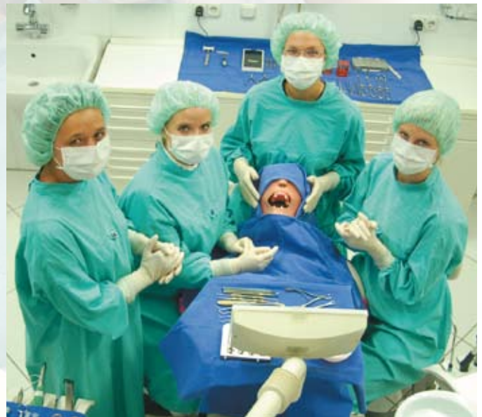
Realistic operation simulation

In a group of three and a supervisor per phantom patient, participants switch positions from assistant to operator. This permits viewing from different positions - helpful when writing ones own implant notes.