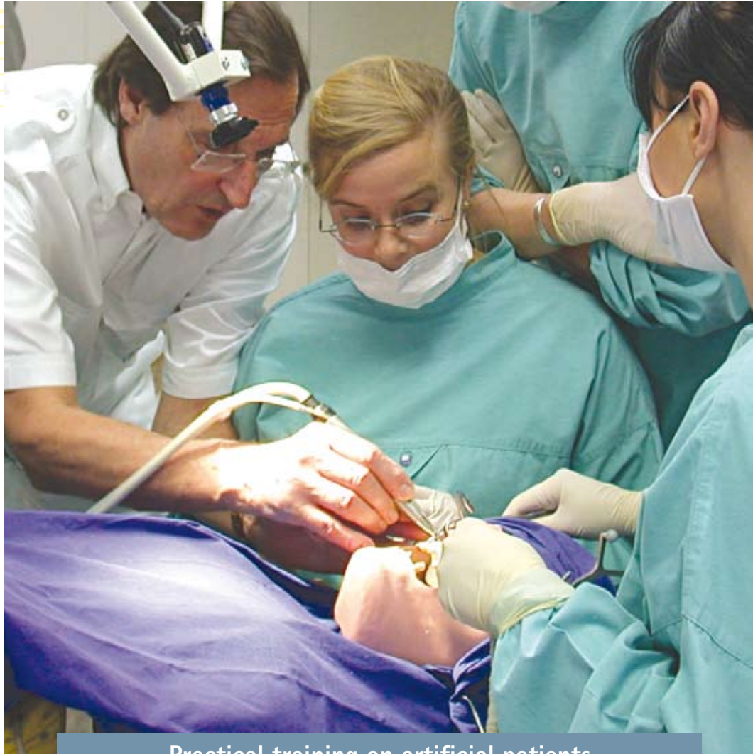
Practical training on artificial patients