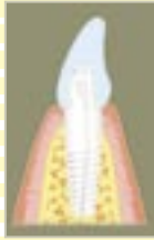
Cross section of implant with single crown