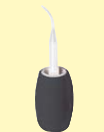
Foam rubber grip lining 4 pieces Order No. 140 0096 4