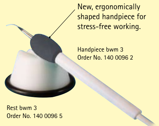
Rest bwm 3 Order No. 140 0096 5