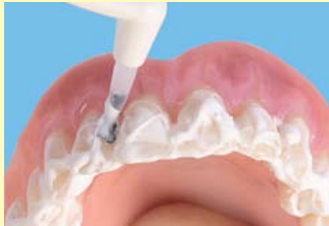
The silicone varnish has set after a few minutes.