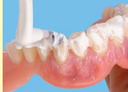
The varnish is spread with a brush.