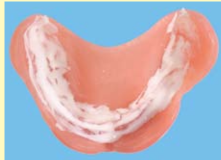
To be able to determine the thickness of the mucosa, the basal area is coated with X-resin flow.

If a DVT is available in the practice, X-resin flow can be used to avoid the complex fabrication of a scan template.