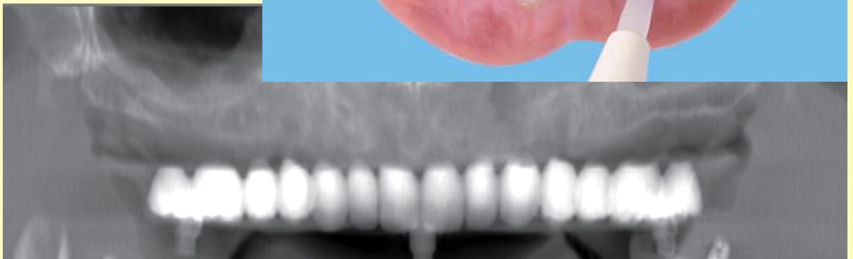
X-resin flow is perfectly visible after the scan (DT/DVT).

The contours of the teeth can be clearly recognized in the scan image (DVT or CT) and thus prosthetically oriented alignment of the implants in the implant planning software is enabled. This facilitates planning considerably. If X-resin flow is applied to the basal area, the thickness of the mucosa can be clearly determined in the scan image. The silicone varnish can be easily removed after the scan.