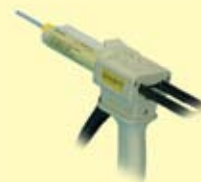
Dosing device 1 piece REF 320 0044 0