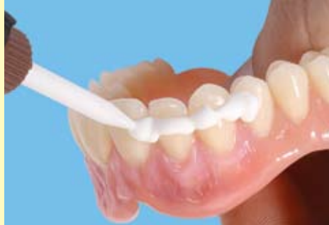
X-resin flow is applied to the full denture.